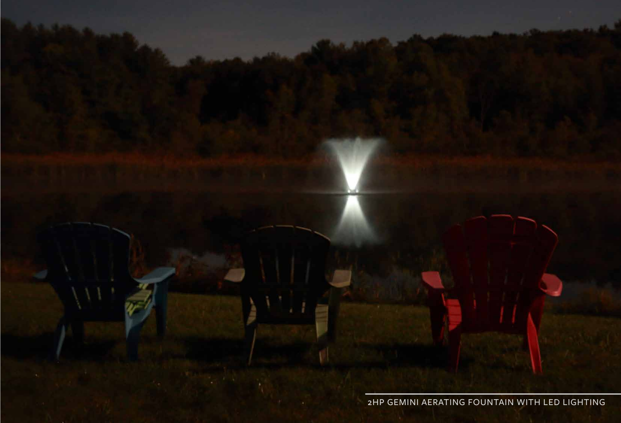
2HP GEMINI AERATING FOUNTAIN WITH LED LIGHTING