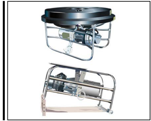
CAD DRAWING: Aspirator Industrial Aerator

ACCEPTABLE MANUFACTURER: This unit shall be an OTTERBINE Aspirator Industrial Aerator manufactured by OTTERBINE BAREBO, INC., 3840 MAIN ROAD EAST, EMMAUS, PA 18049 U.S.A. PH: (610) 965-6018. WEB: www.otterbine.com