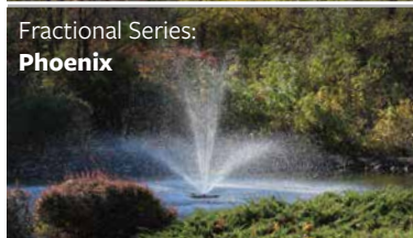
Fractional Series: Phoenix