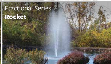
Fractional Series: Rocket