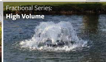
Fractional Series: High Volume