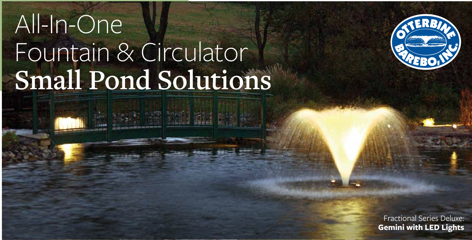
Fractional Series Deluxe: Gemini with LED Lights