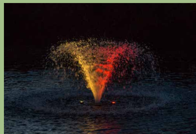
MINI-RGBW LIGHT SET ON A 1/2HP FRACTIONAL DELUXE UNIT Patterns (clockwise left to right): Rocket, Phoenix, Gemini.