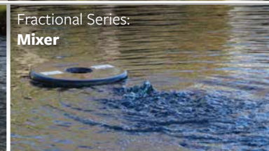
Fractional Series: Mixer